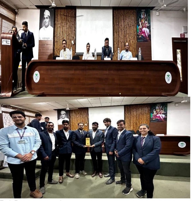
Tech-Fest event at a glance.