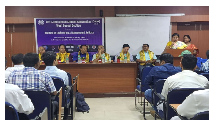
Dignitaries on the dais during the Annual Students Convention of ISTE West Bengal Section

The certificates were distributed to the winners based on their academic excellence and contribution towards their institutions and society. There were more than 1000 participants from all over West Bengal participated in the event.