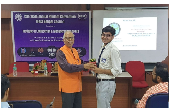
Distribution of Certificates by the dignitaries to the students